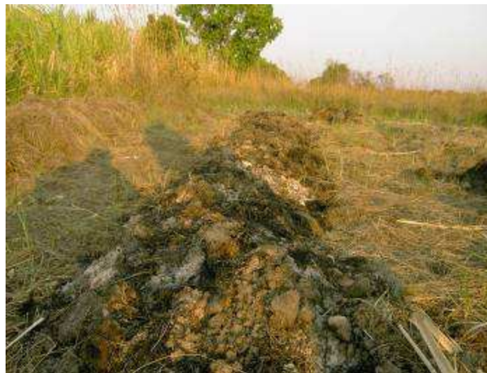
A burnt ridge which needs to be earthed up to bury the potash

Burying covers the potash preventing its removal by wind. Also, it is important to bury the potash before it starts to draw water from the ground, as this would accelerate moisture loss.