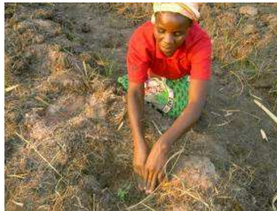
Hygroscopic action of ash at the planting station drawing moisture up to the middle of the ridge

Seed holes or planting stations should be made deep enough (about 10cm), in the centre of the ridge of sterilized and now friable clay soil. This should be done in such a way that some potash is present in the planting hole, to encourage ground water to rise to the rooting zone.