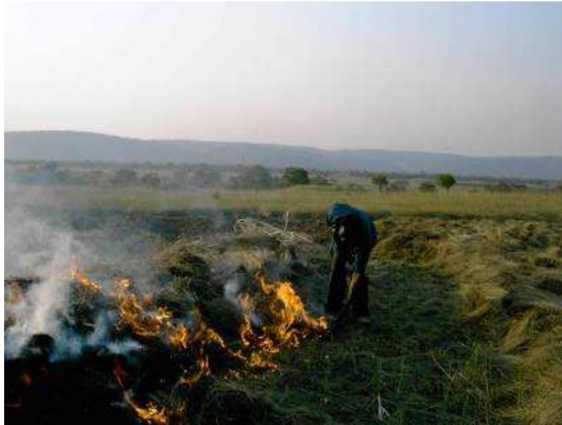
Setting a ridge of turfs alight