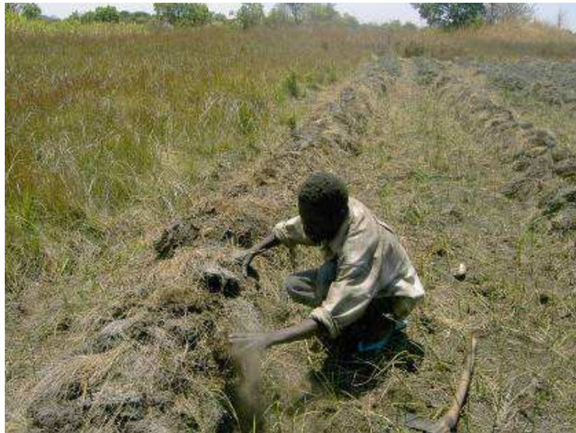
Mounding the dried turfs into ridges for burning