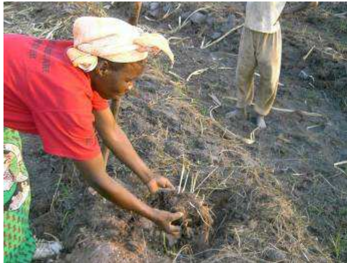
Making a planting station in an earthen ridge

the groundwater, no extra water may be needed up to harvest time, while in other cases some irrigation is needed, but only at intervals of two to four weeks.