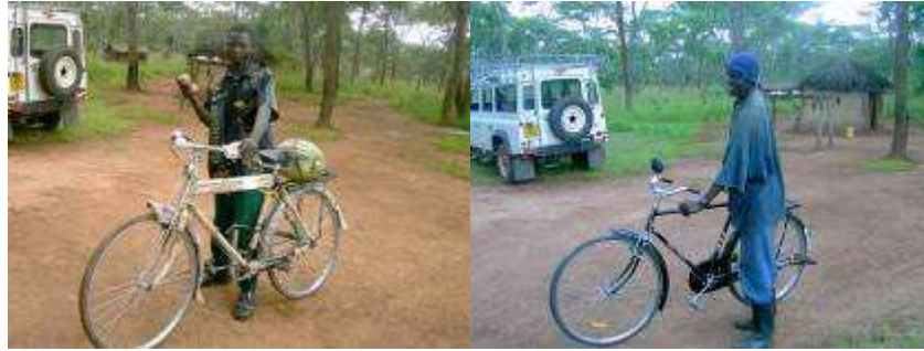
Purchase of assets, such as bicycles, by first-time dambo farmers