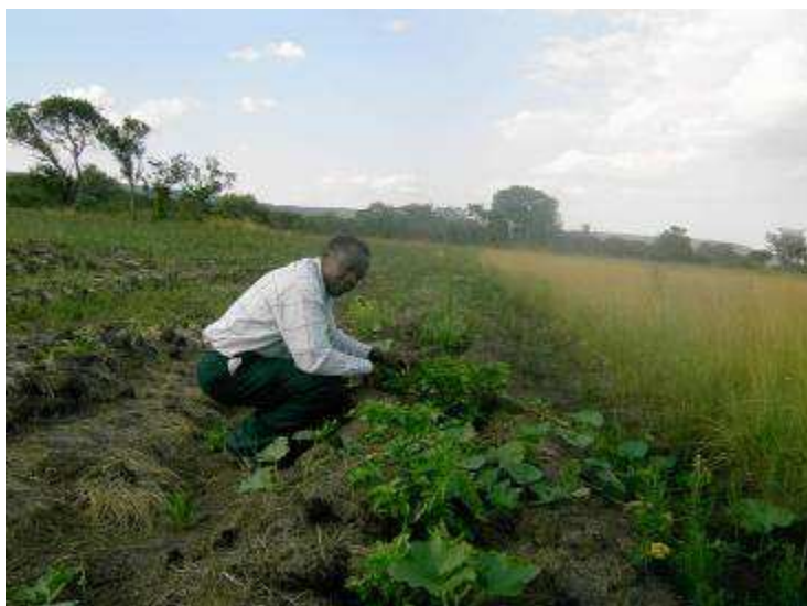
“Chibwabwa” a delicacy vegetable is ready in November and squashes by December.

These different cropping patterns can either give a regular replenishment of foodstuffs at the household level all year round or enable the household to sell produce during the lean months / hungry season of the year from November to March. This enables the farmer to purchase inputs, such as fertilizer, for upland farming for the next rainy season, with off-season crops that fetch good prices.