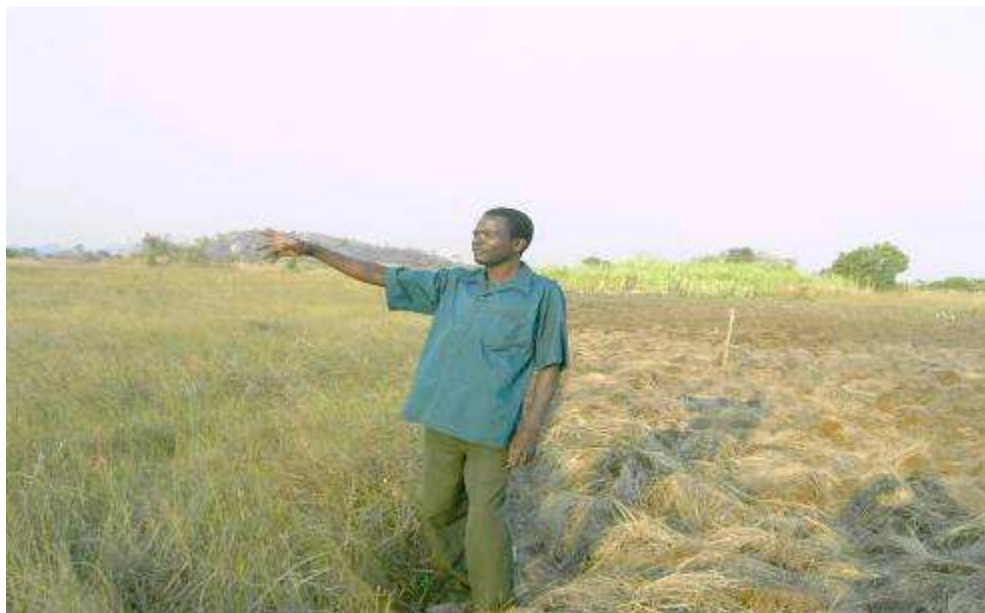
Typical dambo terrain which farmers are selecting for cultivation

Generally the dambos of Northern Province are sour, meaning they are acidic and their nutrients cannot be utilized since they are “locked up”. The other limiting factor is high water levels, which can make some areas water-logged for a good part of the year. A further problem is the heavy clay soils which have poor aeration which slows the root growth of plants. These conditions mean that to farm in these dambos some manipulation has to be made to create favorable conditions for plant growth. Once this is done a wide range of crops can be grown including onions, pumpkins, tomatoes and Irish potatoes as possible first crops – often in some combination, followed by maize, rice, squashes, vegetables, beans and sweet potatoes as second and third crops. Sugarcane was used by some farmers as the last crop in the rotation but it is strongly discouraged now as it draws large amounts of water from the dambos and can dry them out in those areas.