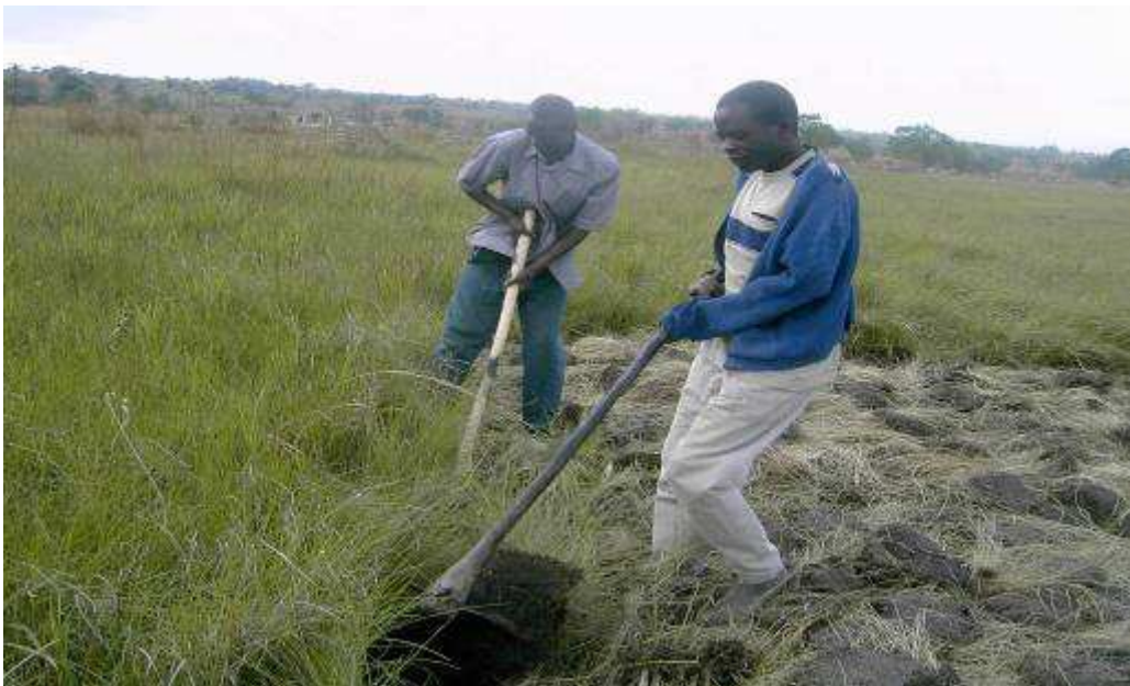
Stripping turfs from a dambo to prepare a garden