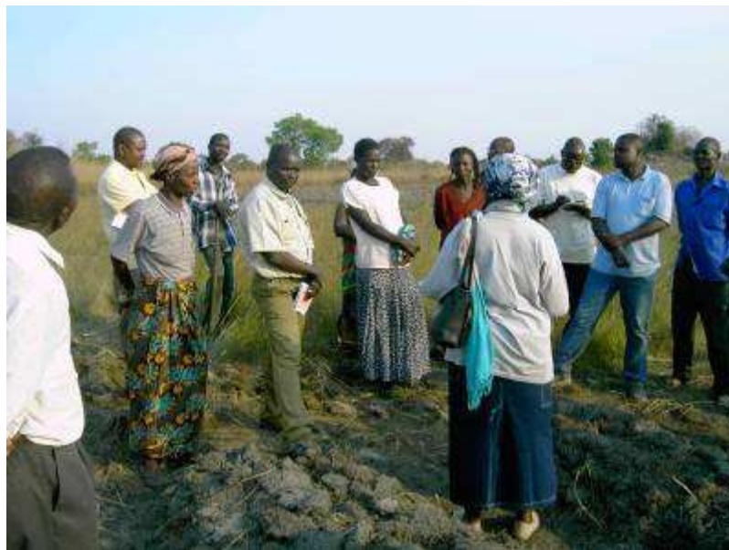
Harvest Help Sustainable Agricultural Forum Members visiting a new dambo garden at Mwansabamba