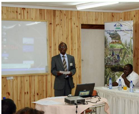
Policy dialogue; opening of a roundtable meeting of government and NGO stakeholders