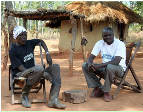
Learning how it really is – ground-truthing for policy development