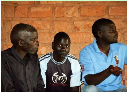
Community discussions of wetland management must inform national policy making