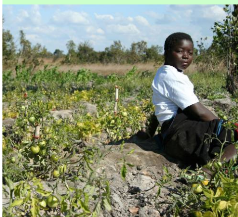
Wetlands are valued by a range of stakeholders for different reasons