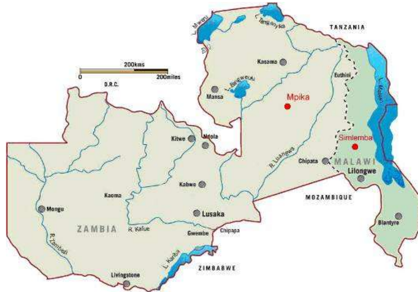
Figure 1: SAB Project Areas at Mpika, Zambia and Simlemba, Malawi.

The “Striking a Balance” (SAB) Project worked in six wetland demonstration sites, three in Zambia and three in Malawi. These were within pre-existing projects run by local NGOs in Mpika District of northern Zambia and Simlemba Traditional Authority of Kasungu District in central Malawi (for location see Figure 1).